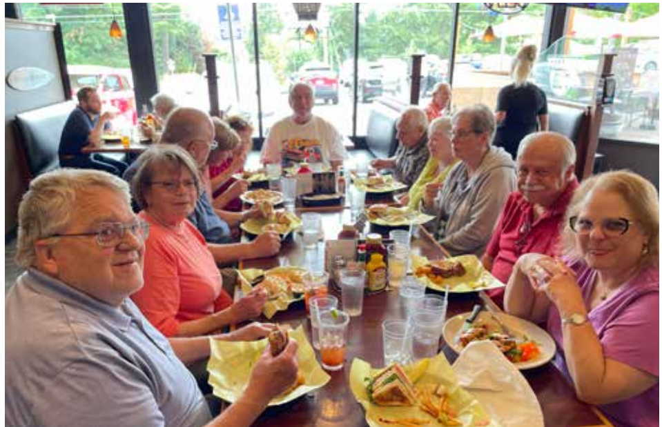
Mayflower tours usually involve lunch someplace pleasant, and this time it was the Linn City Pub in West Linn, where CPPC members regained their strength after trekking around extensive gardens at Luscher Farm. Next up, sometime in August, Mayflowers will be touring the Pearson Air Museum and Officers Row at Fort Vancouver, WA.

Next month we plan on going to Vancouver WA to visit the Pearson Air Museum and Officers Row in the Fort Vancouver area. More information about that will be available in the coming weeks.